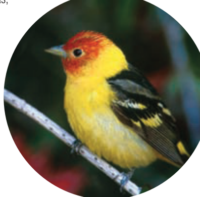
Western Tanager