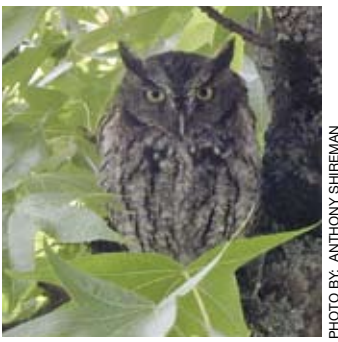
Western Screech Owl

From I-5 Exit 263 N of Salem: go E on Brooklake Rd 1 mi into Brooks. Turn S on Hwy 99E and go 2.8 mi to Hazelgreen/Chemawa Rd (crossing Lake Labish Ditch, see note below). Turn E on Hazelgreen Rd and follow 10 mi into downtown Silverton. Turn R onto Main St/Cascade Hwy. The entrance to the Oregon Garden is about 0.2 mi on the L. GPS 45° 0.3' N, 122° 47.0' W.